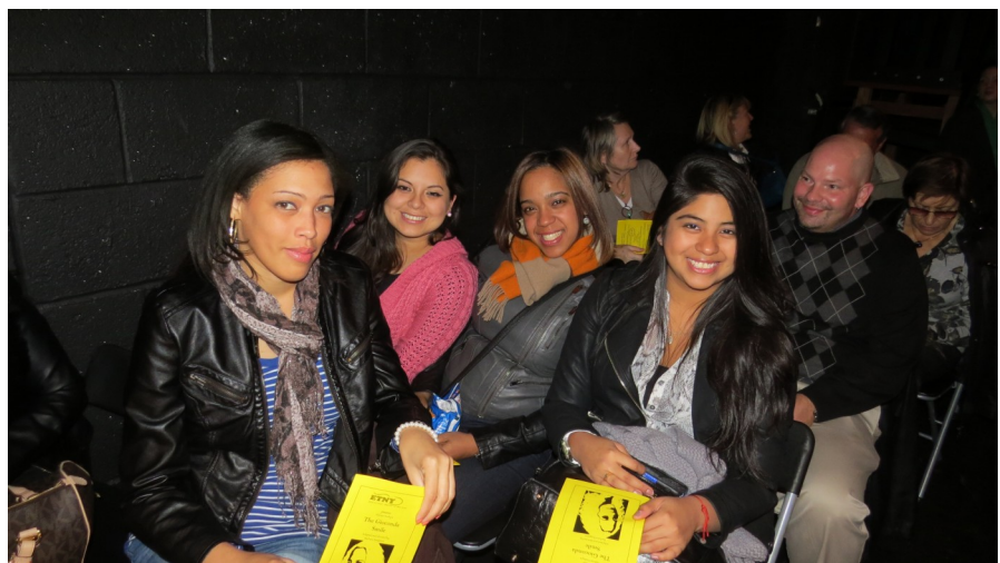
It's all smiles at the Gioconda Smile , a play for ESL learners

The Gioconda Smile was a charming adaptation that truly focused upon audience interaction, comprehension and appreciation of not only theater but the arts. The venue was small and the setting very intimate, so that the divide that conventionally exists between the actors and the spectators was all but nonexistent.