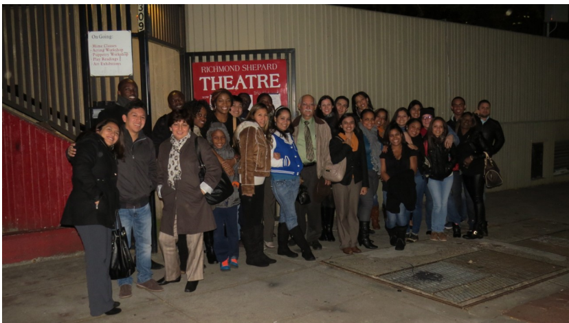
ECC Students and Professors at the Richard Shepard Theater